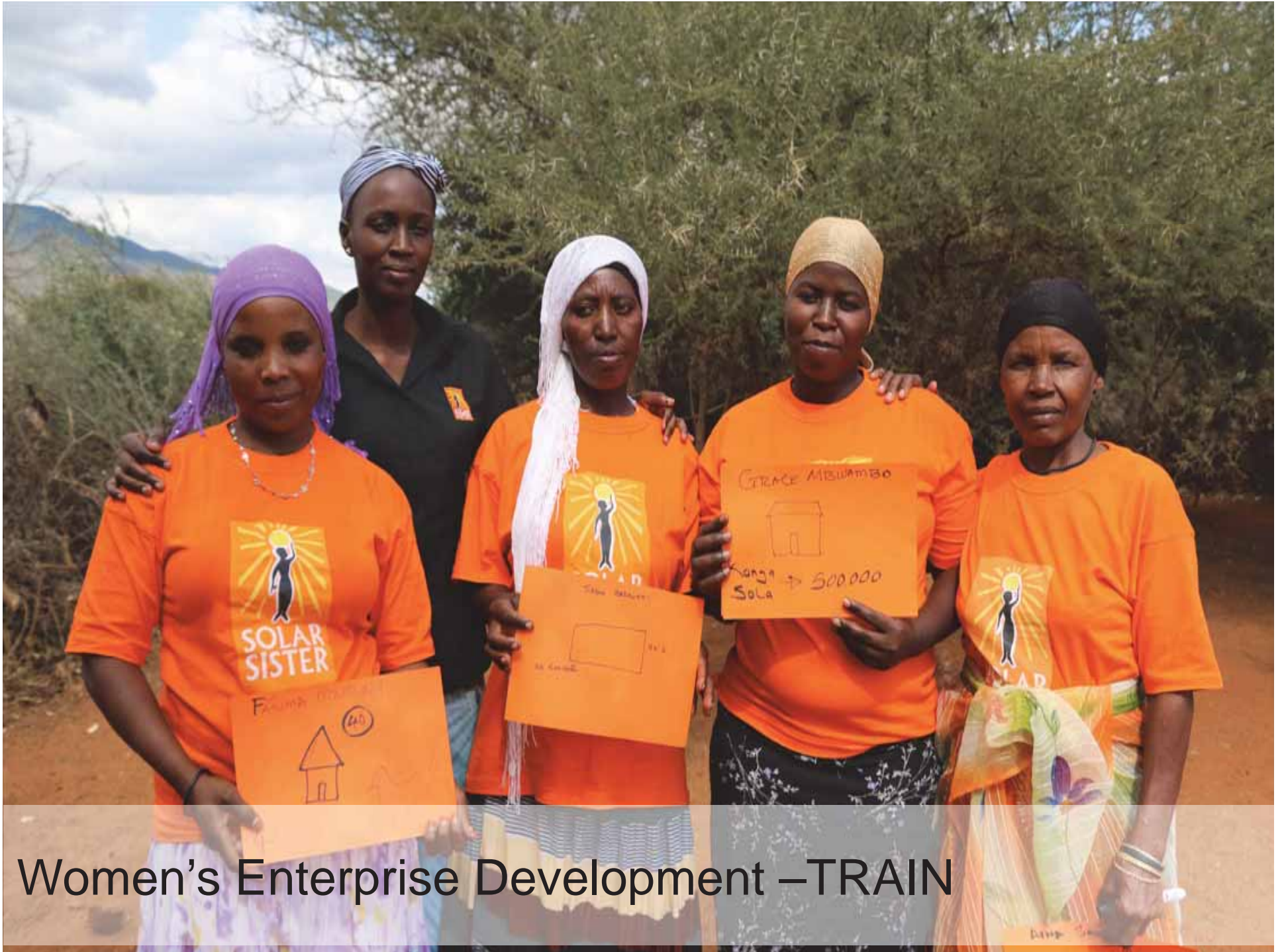
Women's Enterprise Development –TRAIN