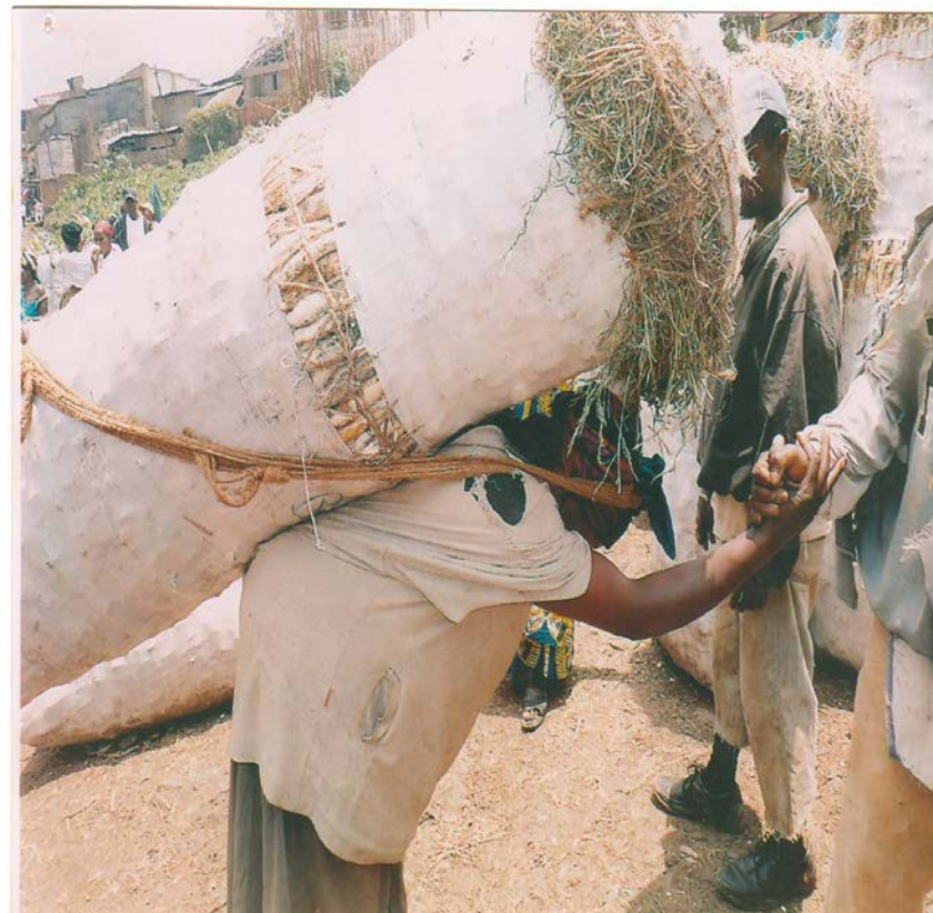
The same heavy bag carried by 1 woman