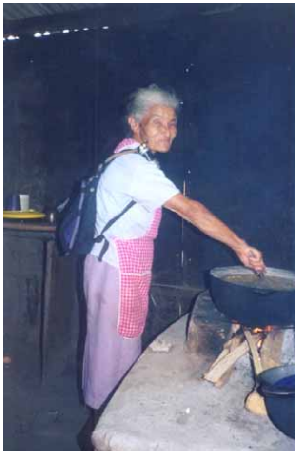
Figure A.1: Study Participant in Ciudadela de San Martin, Tipitapa, Nicaragua: Wearing PM 2.5 Exposure Monitoring Equipment and Cooking Over Traditional Open Fire

Only participants with kitchens with walls on all four sides were recruited for the study, which would make the ventilation rates lower than in typical homes. Since the indoor emissions from cooking stoves would be more concentrated in these kitchens, this participant selection provided greater assurance that we would be able to detect any influence of stove type. However, this selection criterion made the air pollution levels less representative. The CEIHD fieldwork coordinator, Victorina López, selected the homes to create thirty pairs matched according to location (street block) and kitchen type. The kitchen types included: 1) inside a one-room dwelling including sleeping areas, 2) part of the main house, but with a partition separating the kitchen from other rooms, and 3) separate structures apart from living areas and bedrooms. Households with any kind of gas stove were excluded from the study.