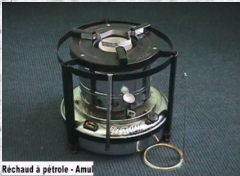
Réchaud à pétrole - Amul