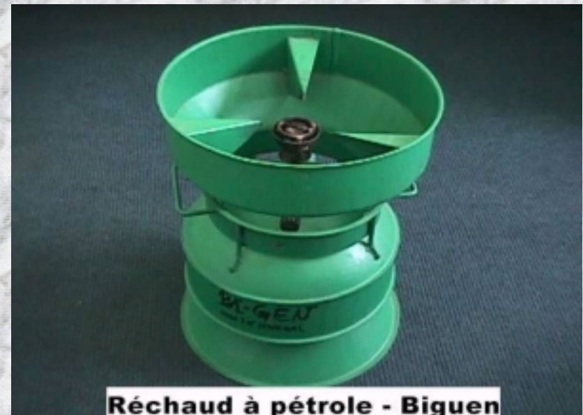
Réchaud à pétrole - Biguen