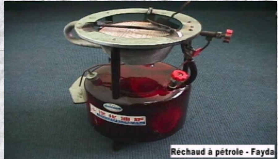
Réchaud à pétrole - Fayda