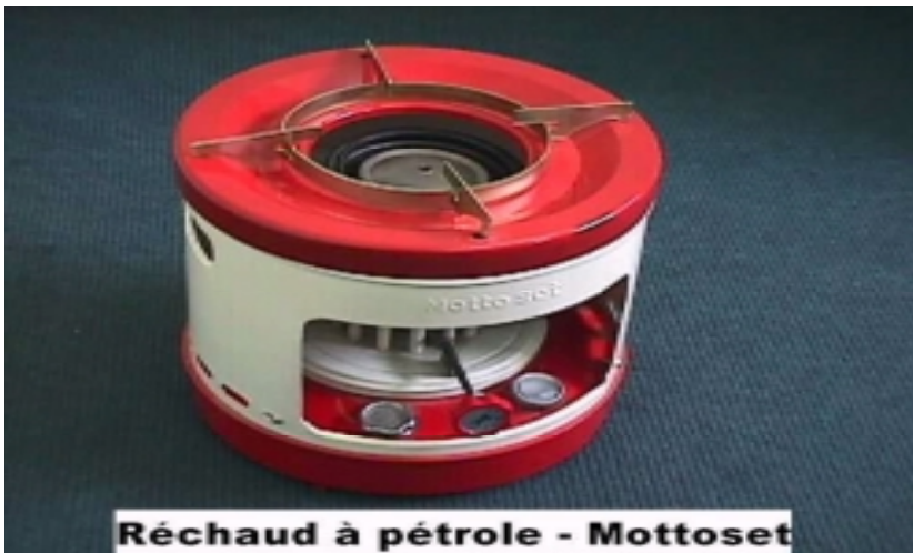
Réchaud à pétrole - Mottoset