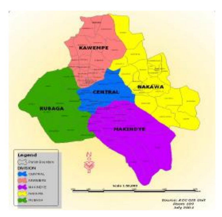
Figure 1 Map of Kampala city showing the five divisions

Below is some socio-economic data<sup>3</sup> on Kampala city that is relevant to the survey: