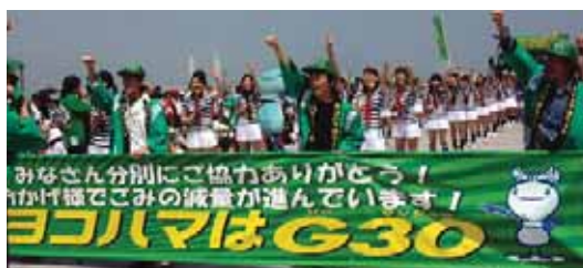
Figure 3.29 Public Awareness Campaigns for Waste Reduction and Separation in Yokohama