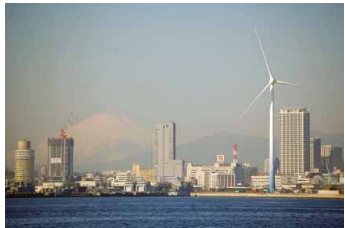
Figure 3.28 The Yokohama Waterfront