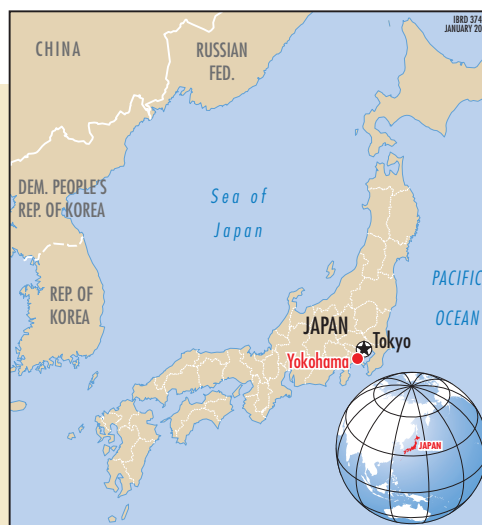
Map 3.6 Location of Yokohama