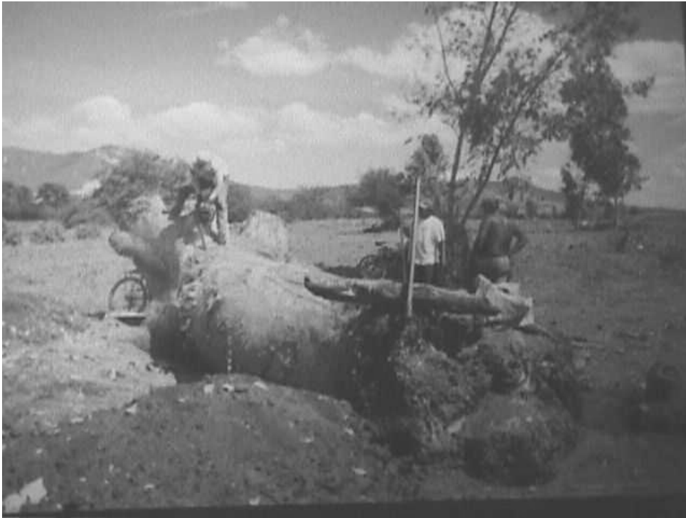
Figure 2. Flood Damage in Posoltega

2.7 The trees and wood used to produce (carbonize) charcoal came from the south side of the Casitas volcano. This area was covered by a dry natural forest containing different types of trees of widely varying sizes—up to 1.5 meters in diameter and 30 meters tall. The flood carried trees and other pieces of wood down to agricultural zones, where they mixed with the soil and rocks (see Figure 2).